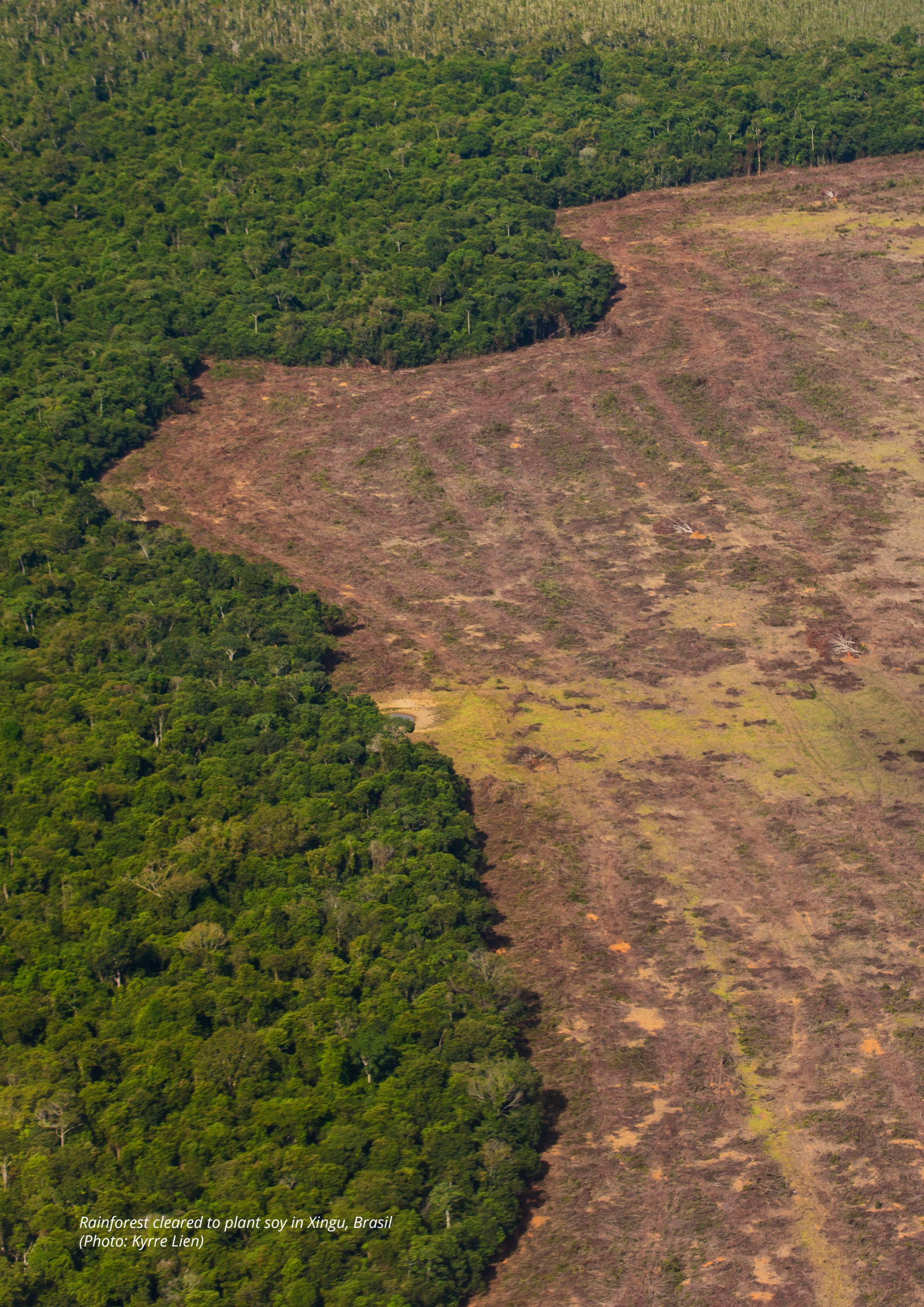
Rainforest cleared to plant soy in Xingu, Brasil