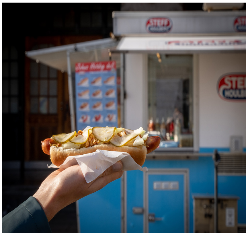
Danish hot dog

Danish Crown has taken steps since our initial contact in June 2019 and has committed to join the “Danish Alliance for Responsible Soy” in September 2019. 25, 26 The Alliance acknowledges the need for concrete measures to ensure responsible protein imports to Denmark and lays out a vision for responsible and deforestation-free soy imports. However, the lack of clear and concrete measures and time-bound goals makes the initiative fall short. The schedule for implementation of its measures is up to each member, and the initiative includes no mechanisms to hold the members accountable for their commitments.