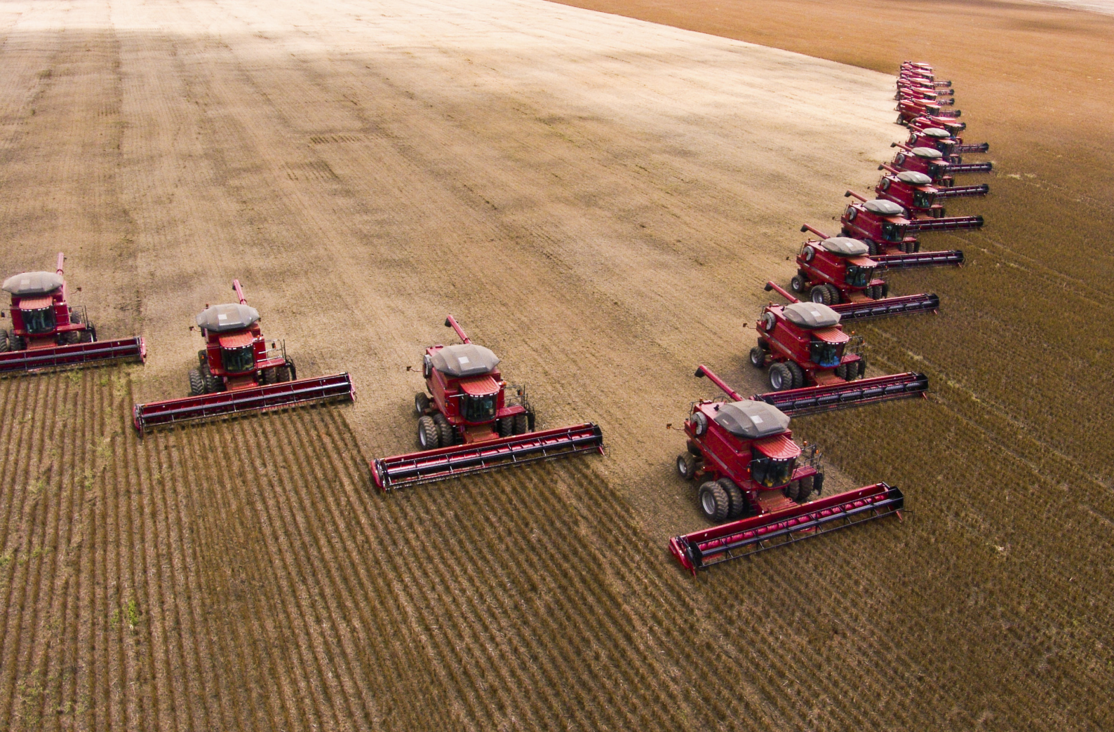
Combine harvesters in soy field in Campo Verde, Mato Grosso, Brasil