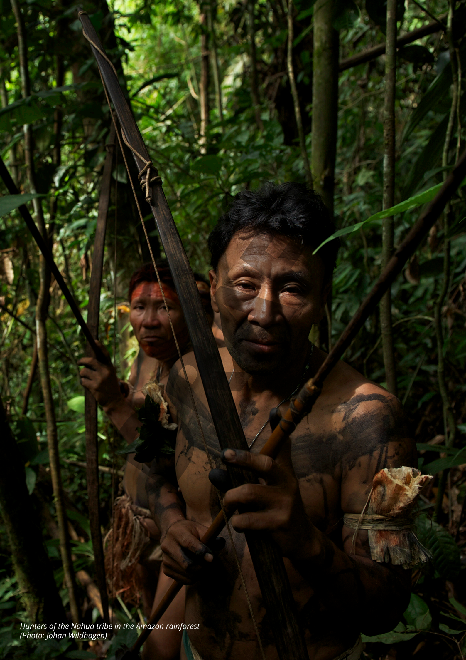
Hunters of the Nahua tribe in the Amazon rainforest